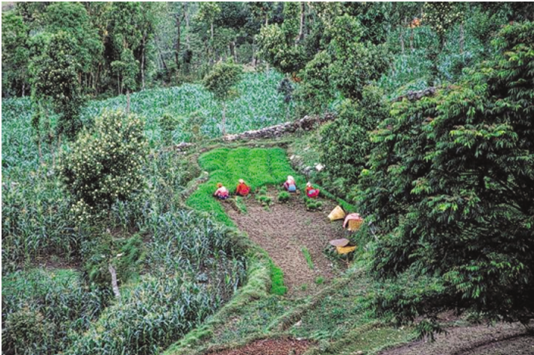
Slide 5 - Conservation through use. On the steep hillsides of Nepal, traditional varieties may be more useful than modern varieties, although they can still be improved by participatory breeding.

In Nepal, for example, IPGRI projects have helped mountain farmers to develop a market for their traditional varieties. As a result, the traditional varieties