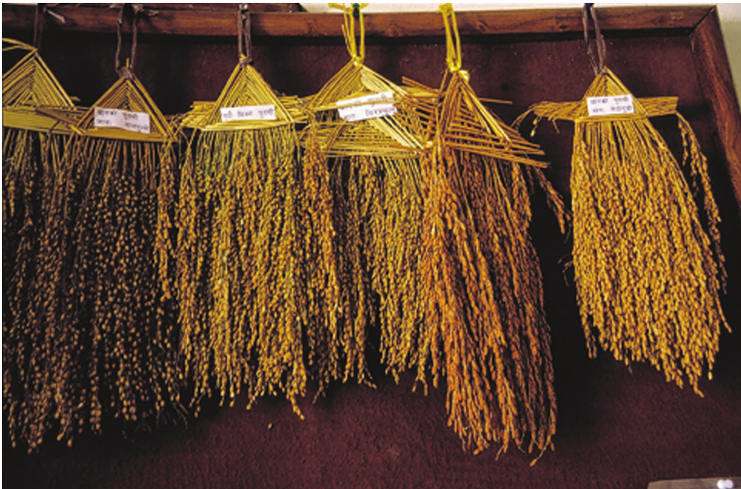
Slide 3 - Rice diversity. A display of old traditional rice varieties in Nepal. By a recent count there were more than 106,000 samples of rice diversity held in genebanks.

It is well recognized that the basis of all agricultural improvement is genetic diversity. From the very beginnings of agriculture, which for rice is probably some 6000 years ago, farmers have exploited naturally occurring diversity. For millennia farmers made use of this diversity to select the crops that performed best for them under their particular circumstances. More recently, very recently if one considers the long history of rice growing, research scientists have entered the picture with rigorous breeding programmes designed to get the maximum harvests from the crop. Even the research scientists, however, depended on the diversity that existed in natural populations.