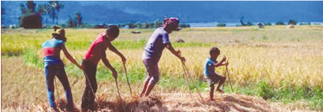
Slide 2 - A family threshes the rice harvest in West Sumatra.

In December 2002, six years ahead of the original objective, the entire sequence of the rice genome was announced by a consortium of research institutions from ten countries. These researchers have opened the book of life for the world's most important crop plant. Rice feeds more than half of the world's population. The huge and collaborative exercise to complete the rice genome, coordinated by the National Institute of Agrobiological Sciences in Japan, has been a tremendous scientific achievement. This paper will explore some of the ramifications of the new era in research that they open up. Unlocking the secrets of the rice genome offers an insight into far more than rice alone. It also opens up several other fields for further exploration. Most importantly, it offers the opportunity to make use of the vast stores of crop diversity held in genebanks and growing in farmers' fields, and makes it more important than ever that we conserve those resources.