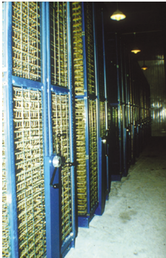
Slide 4 - Collection and conservation. The genebank of the Chinese Academy of Agricultural Science holds more than 64,000 different kinds of rice.

IPGRI came into being 30 years ago as the International Board for Plant Genetic Resources hosted by FAO. Its original mandate was to collect and preserve plant genetic diversity in so-called genebanks. The need was extremely urgent, because although modern agriculture in general and plant breeding in particular depend absolutely on genetic diversity, the very success of modern varieties threatens the existence of that diversity. Successful varieties, ones that produce a higher yield, are naturally adopted over a wide area. But as they spread, these modern varieties can displace tens or hundreds of older varieties, which farmers no longer grow because they cannot compete with the new variety. And yet these old varieties are a massive storehouse of genetic diversity, which breeders are sure to need in the future to meet new challenges.